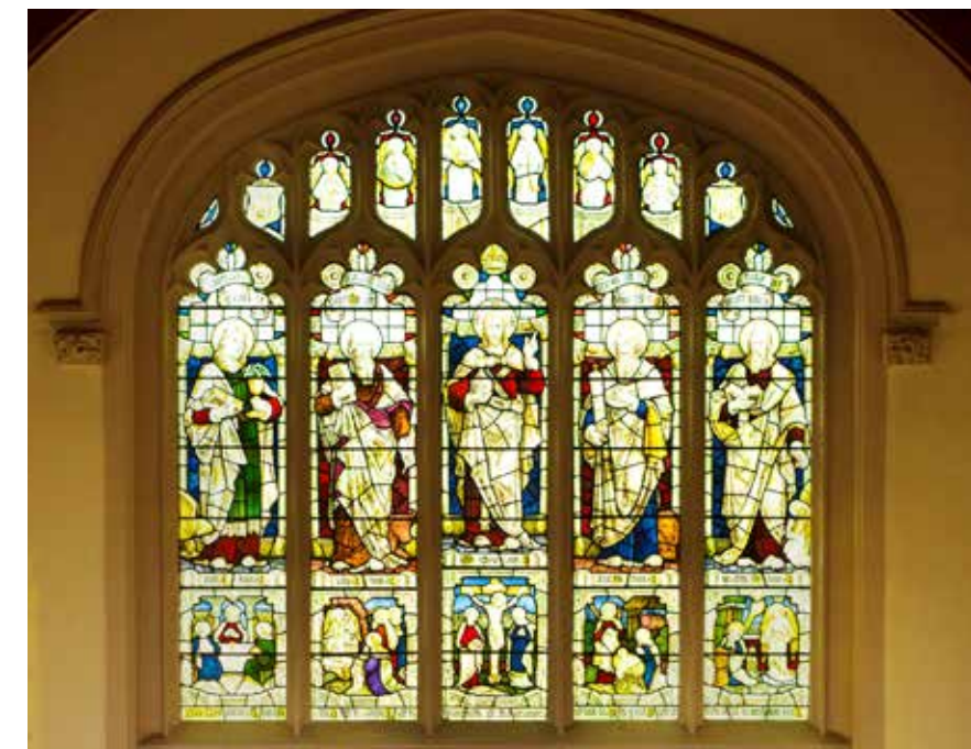
The chapel's east window

Finally, we are delighted to report that we are in the initial planning stages for what we hope will be our first global conference in March 2027, inviting hundreds of delegates to Oxford to participate in one of three content streams (Scholarship, Leadership, Culture & Arts) and to officially launch the next phase of the New Renaissance Project.