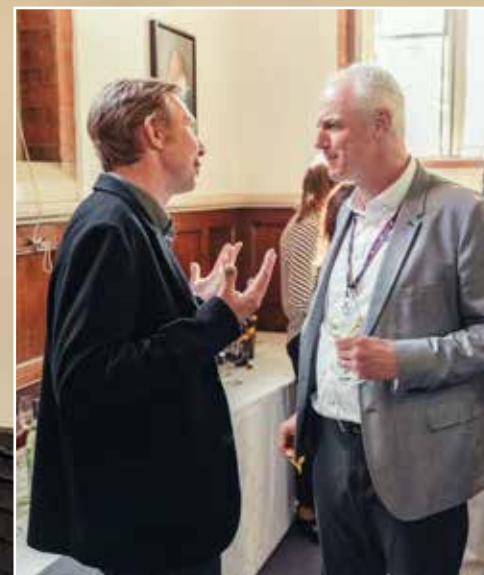
Christians in Business participants